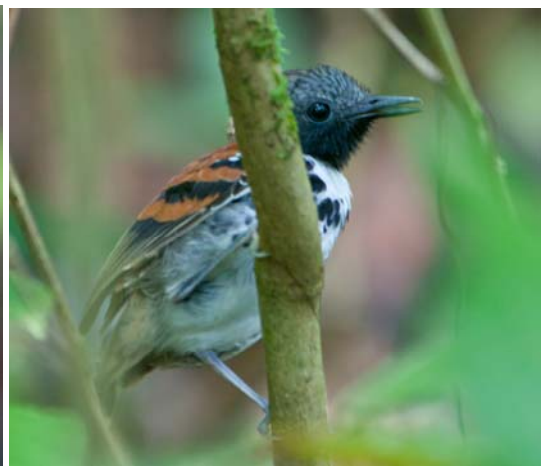
Bi-colored Antbird [Cerro Azul]; Spotted Antbird [PN Soberanía]