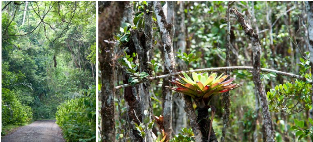
Pipeline Road through Parque Nacional Soberanía; Elfin Forest in Parque Nacional Chagres (Cerro Azul)