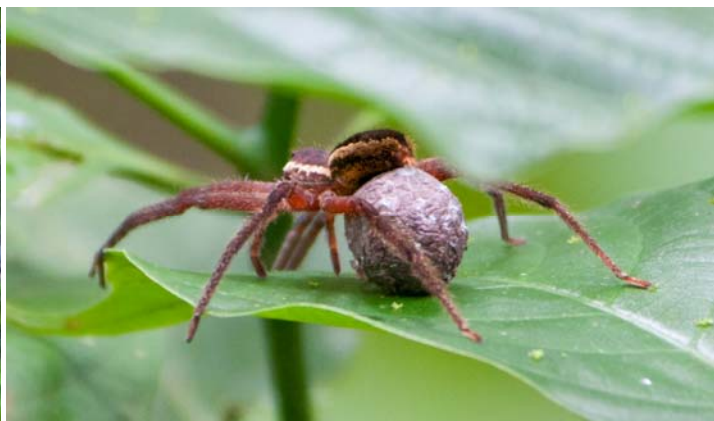
Army ants carrying larvae to new bivouac [PN Soberanía]; Spider and eggs hiding from army ant swarm [Cerro Azul]