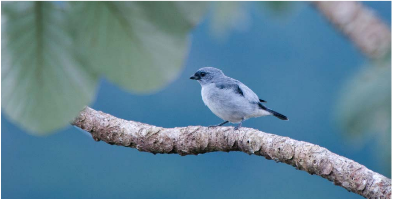
Plain-colored Tanager [PN Soberanía]