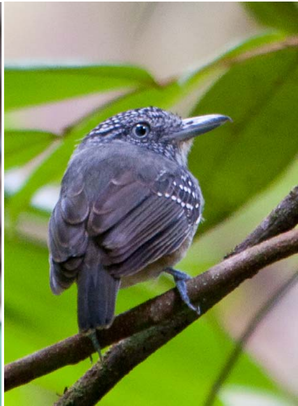
Streak-chested Antpitta; Spot-crowned Antwren [both PN Soberanía]