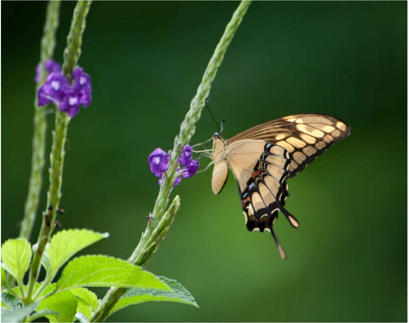
A presumed Thoas Swallowtail (Heraclides thoas) [PN Soberanía]