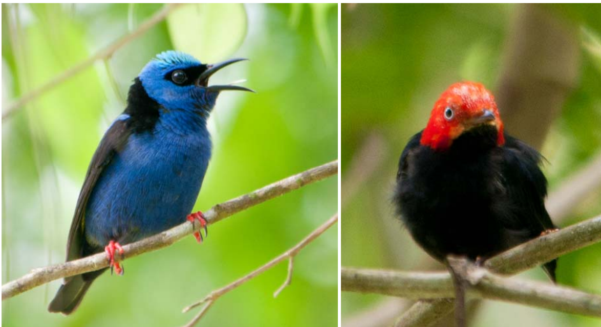
Red-legged Honeycreeper [Cerro Azul]; Red-capped Manakin [PN Soberanía]