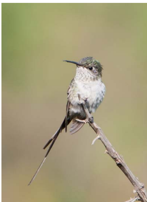
Blue-and-yellow Tanager; Peruvian Sheartail (both Santa Eulalia valley)