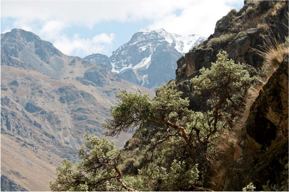
Polylepis forest above the Rio Paccha