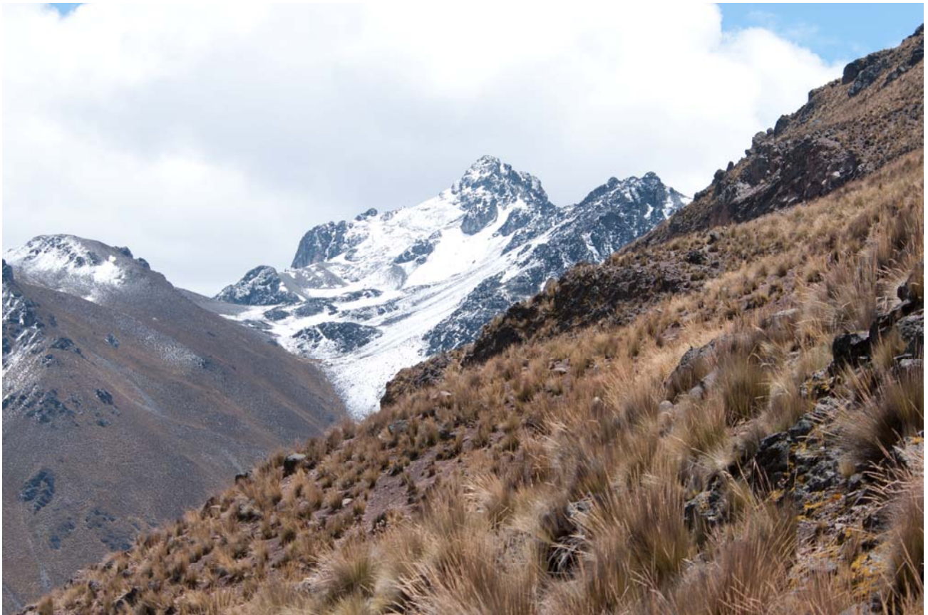
Puna landscape at Milloc in the Cordillera de la Vidua