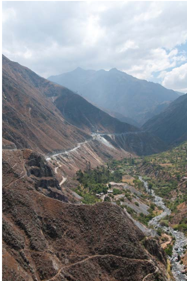
View along the Santa Eulalia valley